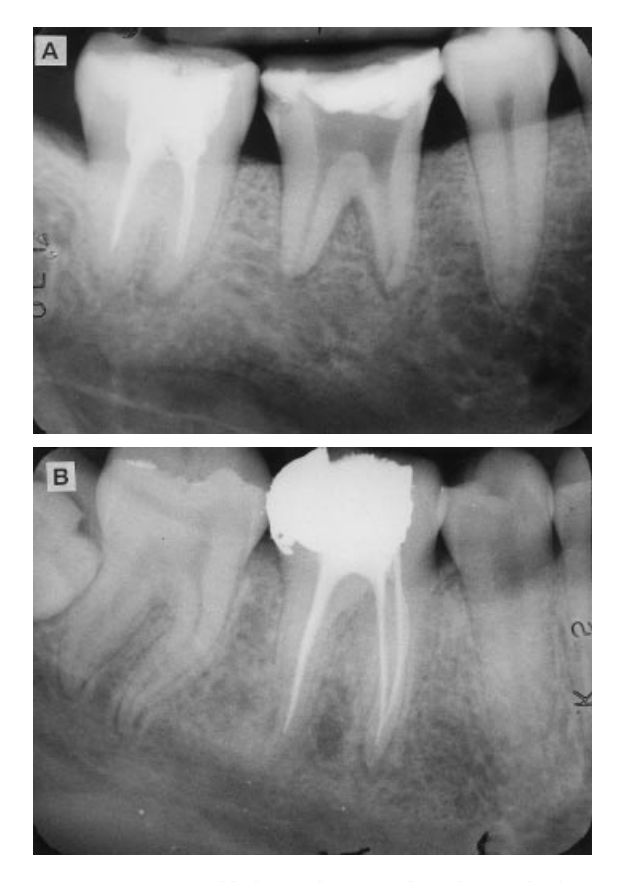
Figure 3 (a) Mandibular right second molar with four metallic core gutta-percha carriers short of the ideal length (case 16, Table 1). Canal space was not clean and the patient complained of pain to cold stimulation. (b) Mandibular right first molar with three metallic core gutta-percha carriers in contact with the coronal amalgam restoration (case 11, Table 1). Patient was experiencing intense pain in response to cold.

these metallic cores may be in contact with the metallic coronal restoration (Fig. 3b) (Gutmann & Battrum 1994).