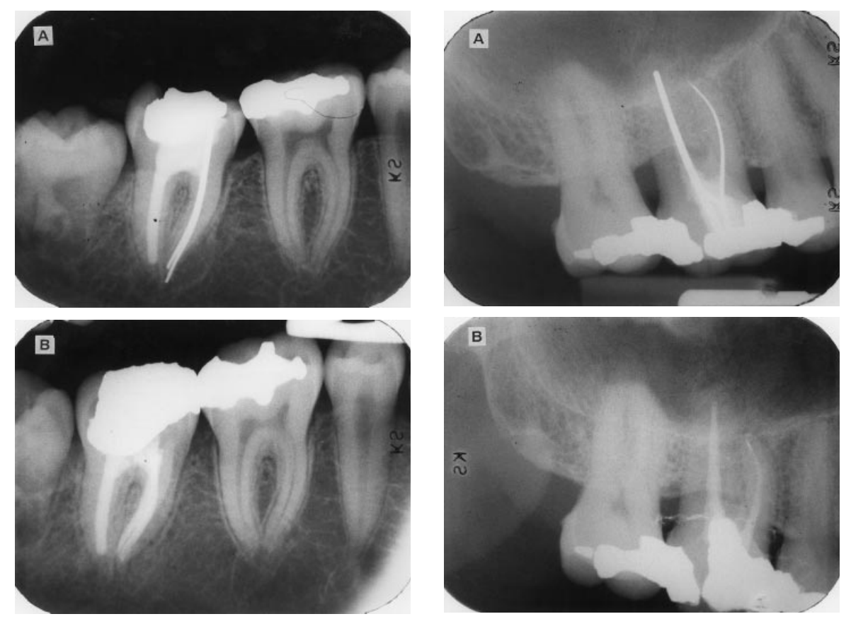
Figure 1 (a) Mandibular right second molar with silver cones beyond the end of the root. Cones are also in contact with occlusal amalgam (case 2, Table 1). (b) Mesial canals retreated within confines of the root.

should proceed in a logical manner to determine the cause. Reproduction of the patient's chief complaint is a significant step in diagnosis (Keir et al. 1991, Gutmann & Lovdahl 1997). Table 2 lists some of the possible causes for this sensitivity. A given case may present any combination of these causes, but the first step should be to assess the quality of the previous root canal treatment. Whilst limited to a two-dimensional radiographic evaluation, the canals should be assessed for shape and thoroughness of obturation. The determi-