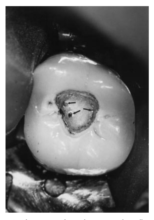
Figure 6 The arrows indicate the position of metallic core carriers that were in contact with the metallic crown. This caused significant pain in response to cold stimulation.

periodontal C fibres seem to be similar to those of the pulpal A- \delta fibres and pulpal C fibres (Jyväsjärvi & Kniffkik 1989, Mengel et al. 1993). The high threshold to mechanical stimulation of the periodontal C fibres suggests that they might play a role in periodontal nociception (Mengel et al. 1992). The A- \delta fibres respond to heat and cold (Mengel et al. 1992) and produce nociceptive responses that are interpreted by the brain as pain.