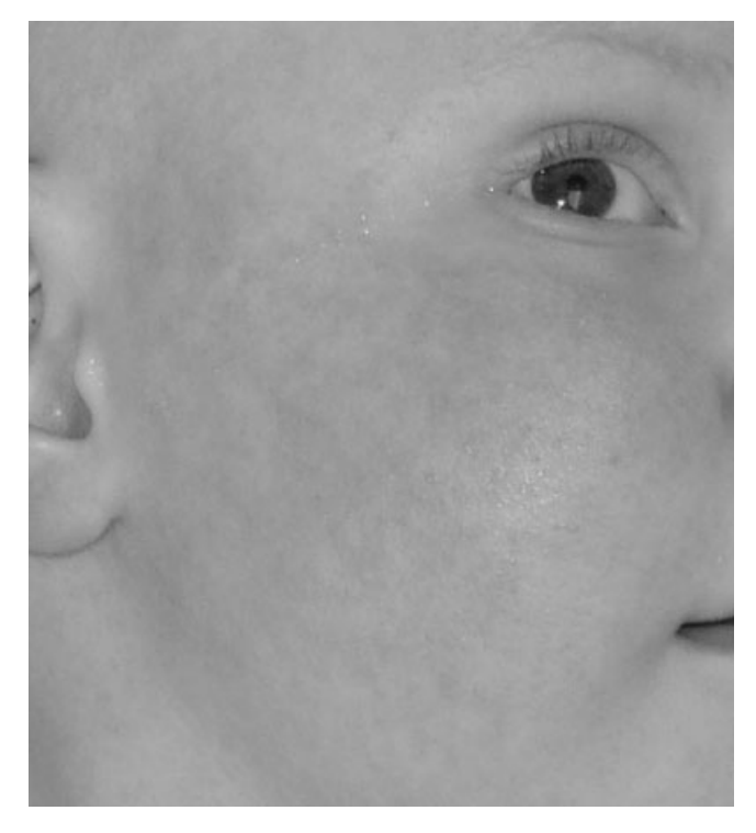
Fig. 2. Dermatitis. Disseminated keratotic papules on the patient's cheek.

An initial evaluation included a renal sonogram that showed moderate hydronephrosis of the right kidney and duplication of right renal collecting system; voiding cystourethrogram was normal. A neonatal echocardiogram, performed because of a murmur, demonstrated a small persistent patent ductus arteriosis and patent foramen ovale; the murmur resolved spontaneously. A head MRI performed at 4 months showed mild ventriculomegaly, and enlarged ventricles were seen on a second MRI done at 16 months. Two electroencephalograms, obtained at 2 months and 14 months for concern about staring spells, were normal; the patient has never had clinically evident seizures. Concern over tracking led to ophthalmologic evaluation at 8 months, which showed marked hyperopia, and the patient was treated with corrective lenses. At 7 months of age a dermatologic evaluation for xerosis revealed eczematous papules, excoriations and scaling on the extremities, trunk,