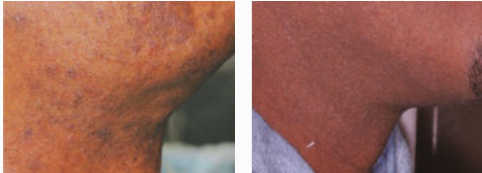
Before and after 3 treatments