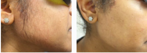
Before and after 3 treatments